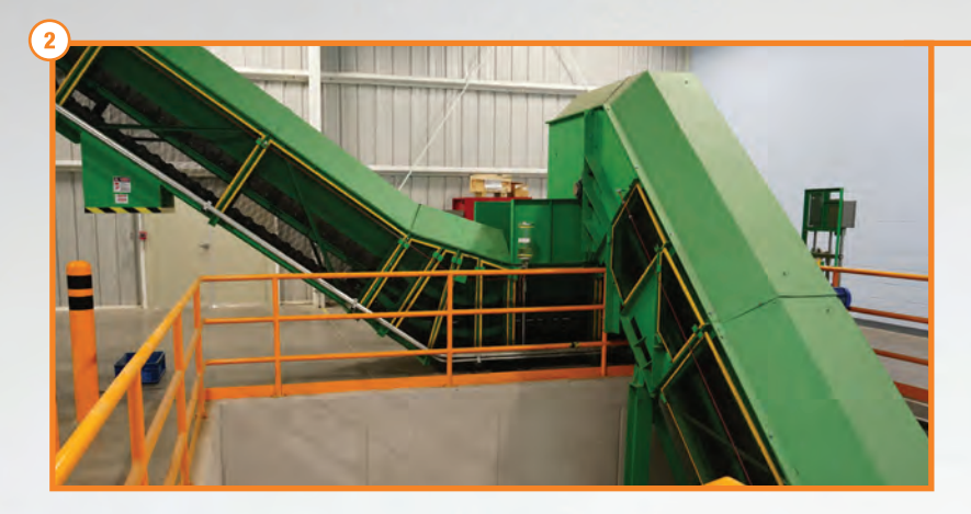
Collector conveyors then gather scrap from multiple press lines or other stamping operations and carry it to your central processing area.