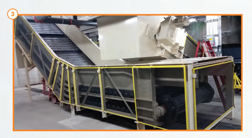
Mayfran hinged steel belt conveyors, shuffle conveyors or magnetic scraper return conveyors are available depending on your needs or preference.