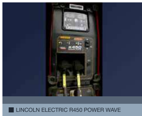
■ LINCOLN ELECTRIC R450 POWER WAVE

Typically, a structural steel fabricator spends a substantial amount of time on labor intensive, repetitive operations such as fitting and welding. Imagine how much simpler things would be if any part of this process could be affordably automated.