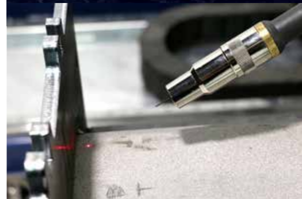
■ LASER TOUCH SENSING OF PART TO BE WELDED

Once the robot has completed the part it returns to the home position, and the operator is then able to turn the beam to the next face to be welded, or remove the completed part and load the next part to be welded.