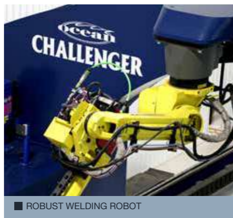
■ ROBUST WELDING ROBOT

Laser curtains ensure a safe working environment for the operator.