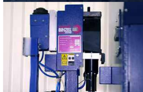
■ TORCH CLEANING STATION