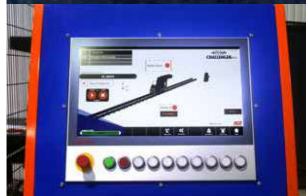
■ EASY-TO-USE GRAPHIC INTERFACE