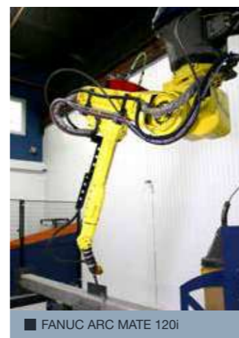
■ FANUC ARC MATE 120i