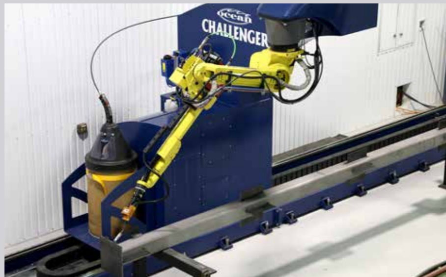
Challenger Robotic Welder Specs